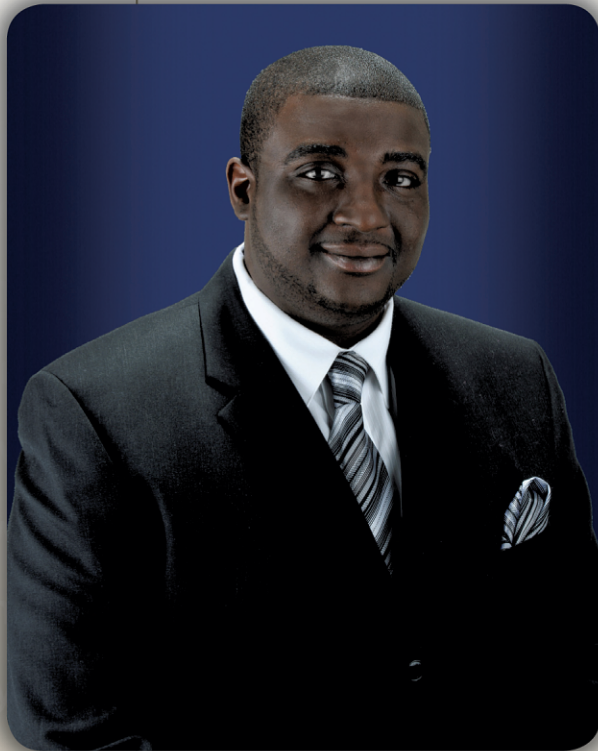
Certified Litigation Management Professional (CLMP)

THE LAW OFFICES OF ATB Adelson, Testan, Brundo, Novell & Jimenez A Professional Corporation